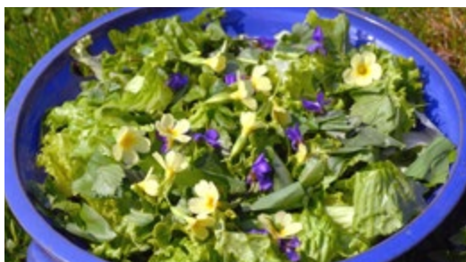
Fig. 5 Edible blossoms