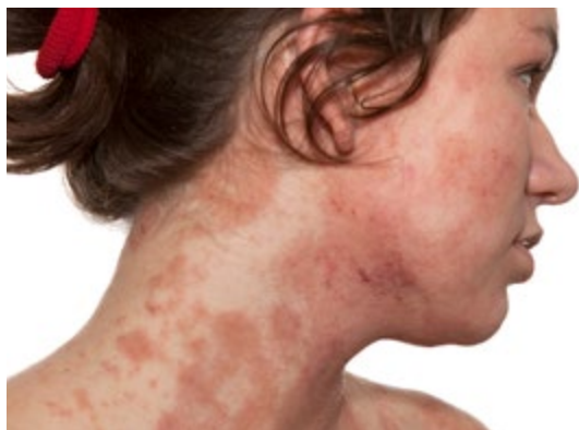
Fig. 11 Neurodermatitis (atopic eczema)

Skin issues always include the immune system and its power to differentiate between the self and others. Nature only allows for subjugation in the case of a fight. In neurodermatitis, the fight is hopeless because healing does not occur by eliminating foods or taking cortisone. A treatment is successful when patients can finally have a fever and sweat again. Consequently, therapy must be conducted through the long path of the destructive carcinogenous layers of the illness through the scrofulous and often also through the scrofulous to the psora in order for it to actually leave the organism through the skin. This does not work without conflict resolution in the family system, especially when children are affected. Some parents prefer to bear the disaster of their child's illness instead of recognising the conflicts that are active within them and manifested by the child. On the other hand, it is almost a miracle to experience how successfully neurodermatitis can be healed when everyone involved is insightful and solution-oriented.