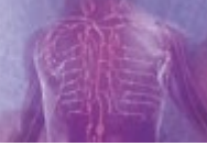
Table 1 Neurodermatitis